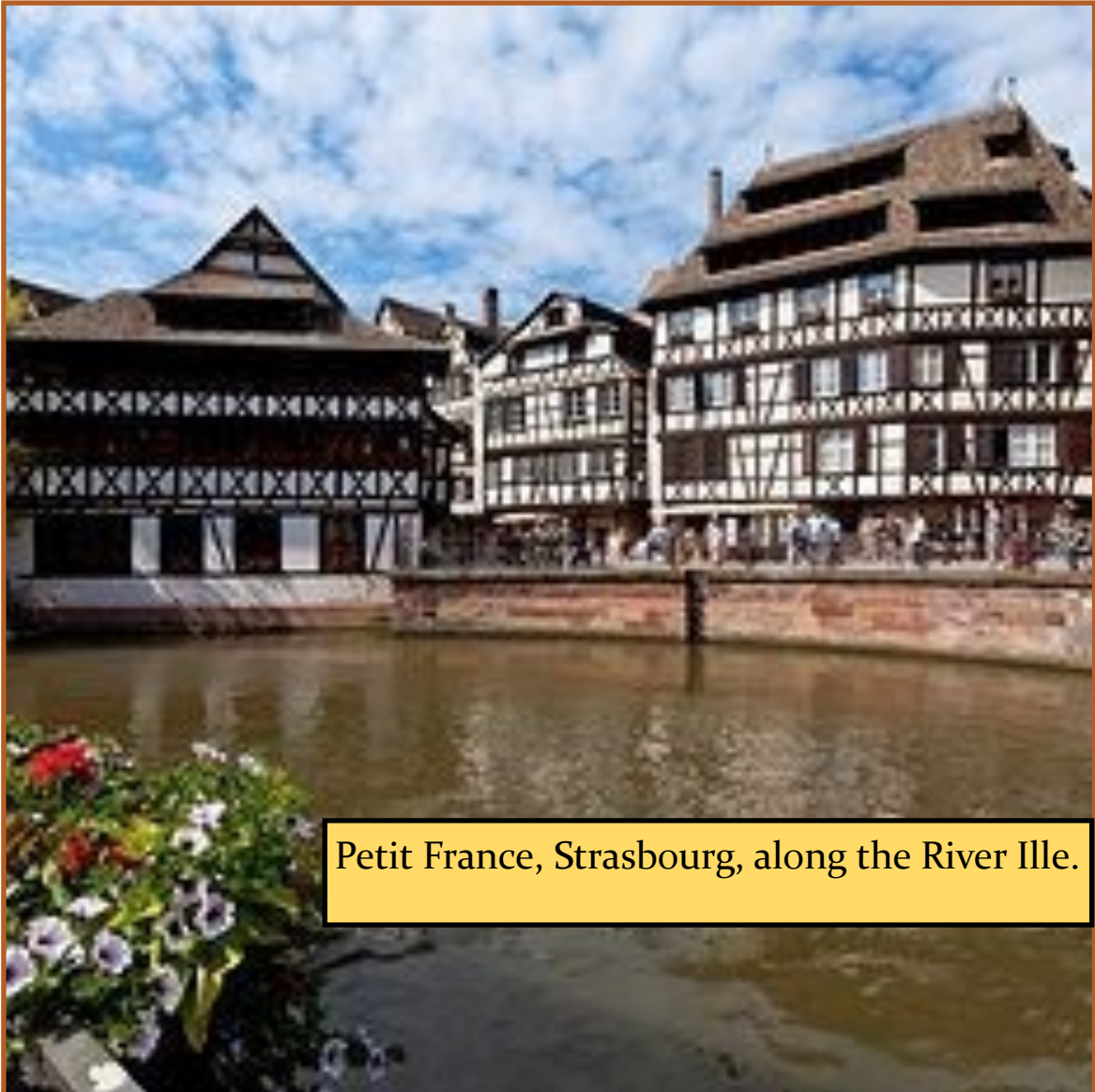
Petit France, Strasbourg, along the River Ille.

Prepare your agenda to include the 2014 Ferree Reunion